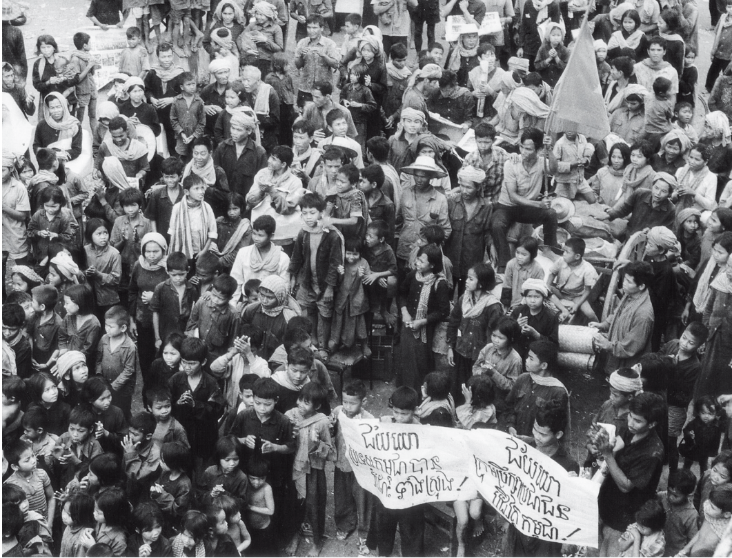
Cambodians rejoicing after liberation, January 17, 1979