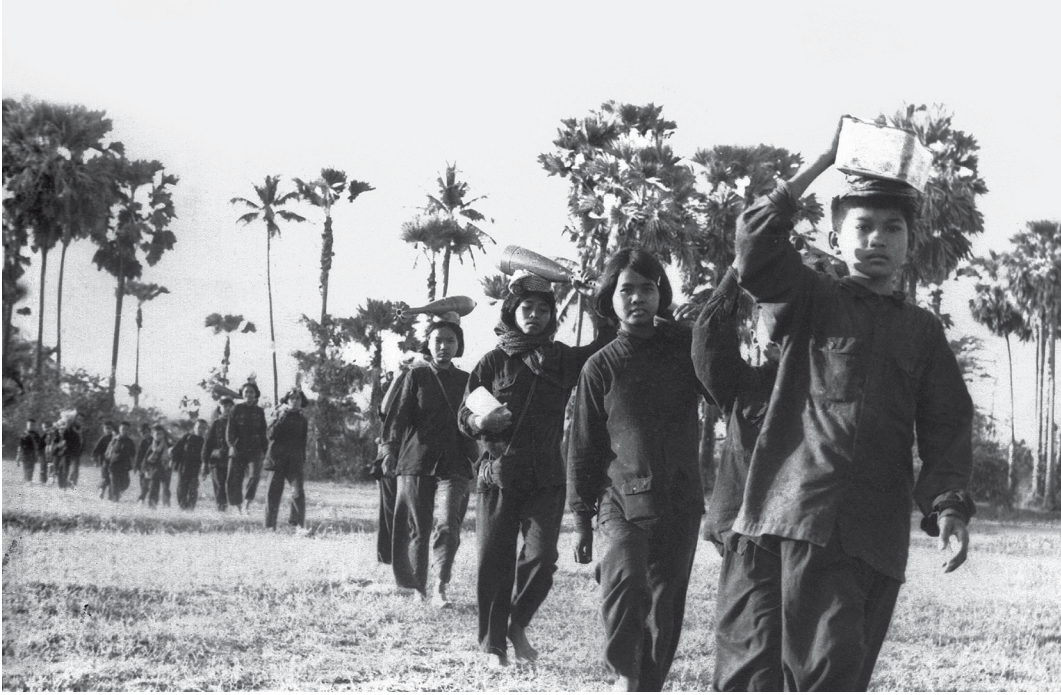
Children at work during Democratic Kampuchea

'Then, from January 1977, all children over about eight years of age, including people of my age [20 years], were separated from their parents, whom we were no longer allowed to see although we remained in the village. We were divided into groups consisting of young men, young women, and young children, each group nominally 300-strong. The food, mostly rice and salt, was pooled and served communally. [...] Also in early 1977, collective marriages, involving hundreds of mostly unwilling couples, took place for the first time. All personal property was confiscated. A new round of executions began, more wide-ranging than that of 1975 and involving anyone who could not or would not carry out work directions. Food rations were cut significantly, leading to many more deaths from starvation, as were clothing allowances. Three sets of clothes per year was now the rule. Groups of more than two people were forbidden to assemble.'