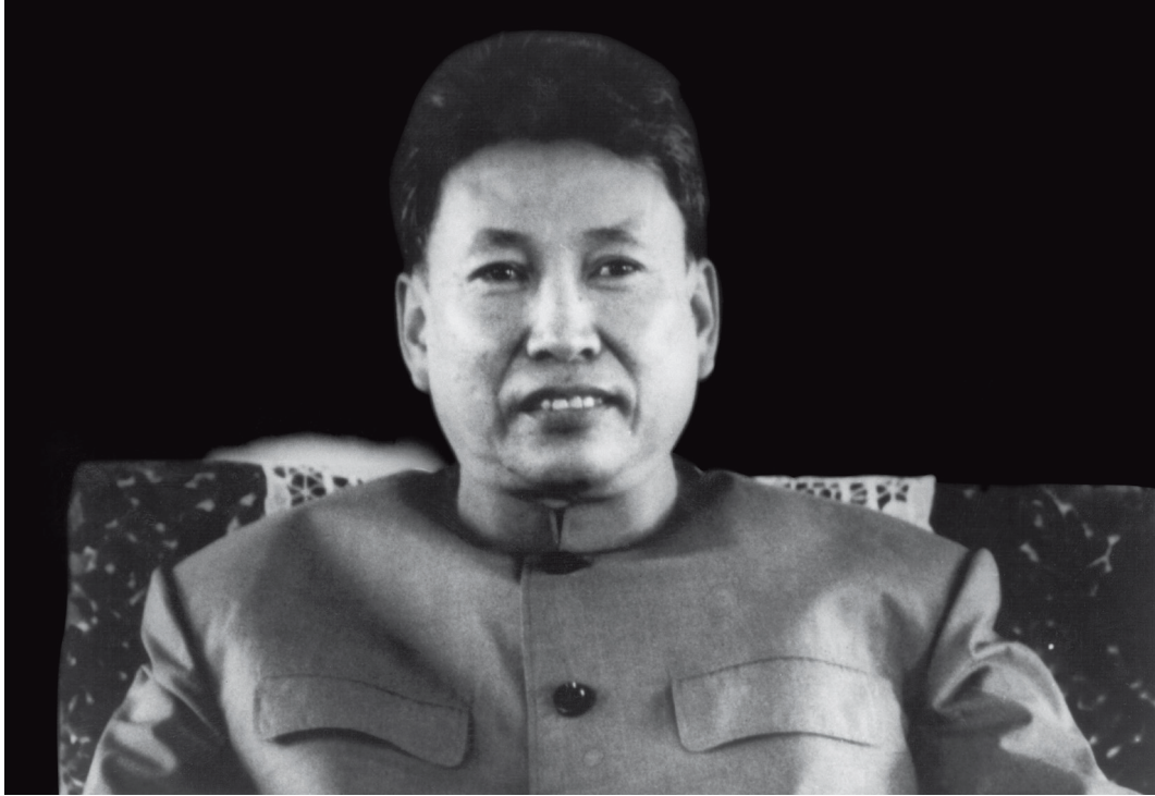
Pol Pot, 1978