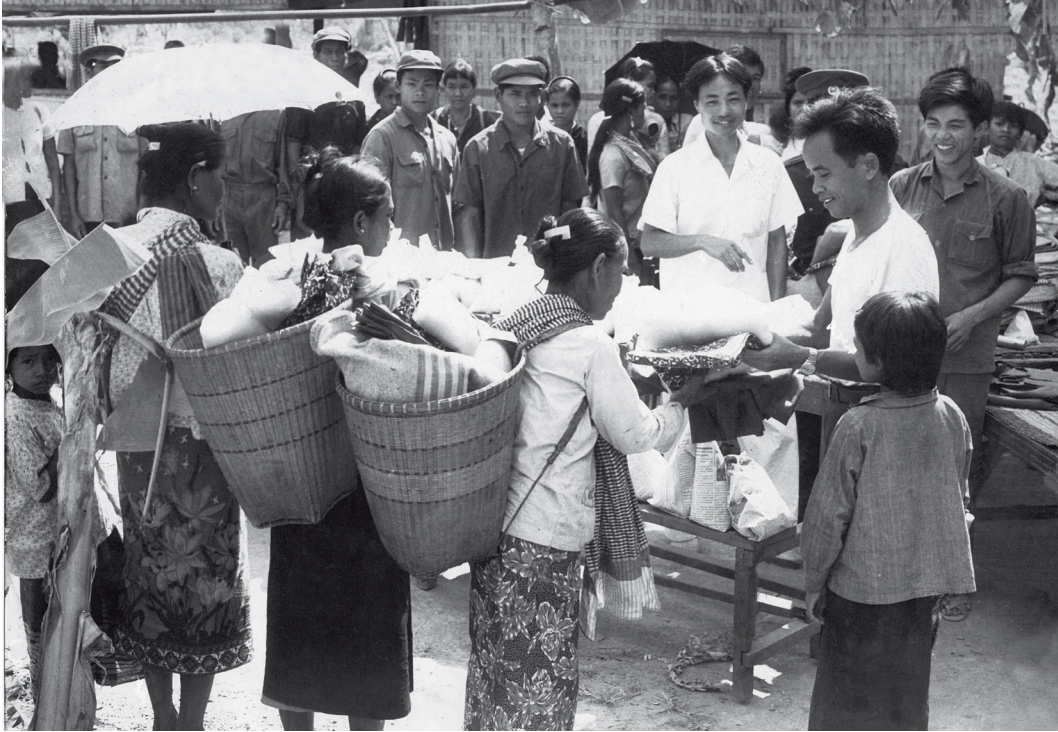
Ethnic people at the market, selling fabrics

tirely eradicated. About half of the 450,000-strong community had been expelled by the United States-backed Lon Nol regime in 1970 (with several thousands killed in massacres). Over 100,000 more were driven out by the Pol Pot regime in the first year after its victory in 1975. The ones who remained in Cambodia were simply murdered.