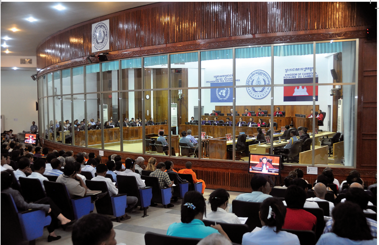
Khmer Rouge leader Deuch sentenced by ECCC, 26 July 2010

Intent — Could ‘genocidal intent’ be proved in the case of Cambodia?