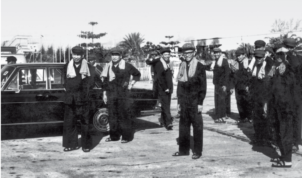
Democratic Kampuchea leaders and members of the Standing Committee of the Central Committee of the CPK

Mok, was CPK secretary of the key Southwest Zone and later Chief of the General Staff of the Khmer Rouge armed forces; and Ke Pauk, Party Secretary of the Central Zone of DK, later became Under Secretary-General of the Khmer Rouge armed forces.